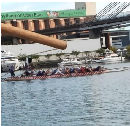
NHTYA Catalina Fleet News March 2023