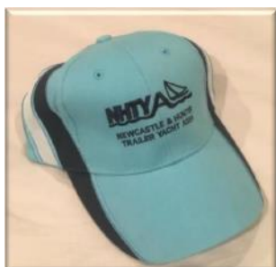
Caps $25 each