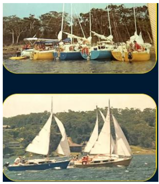
NHTYA Catalina Fleet News -December 2024

Anyway, the picture below on your website (racing pic) I believe captures our boat just behind either Happy Wanderer or the other yellow Sabre (I can tell by the old short -shaft 7.5 Mercury hanging off our transom...I believe we were the ONLY Sabre on the NHTYA that did not have the Volvo Penta inboard...how embarrassing!! | IoI)