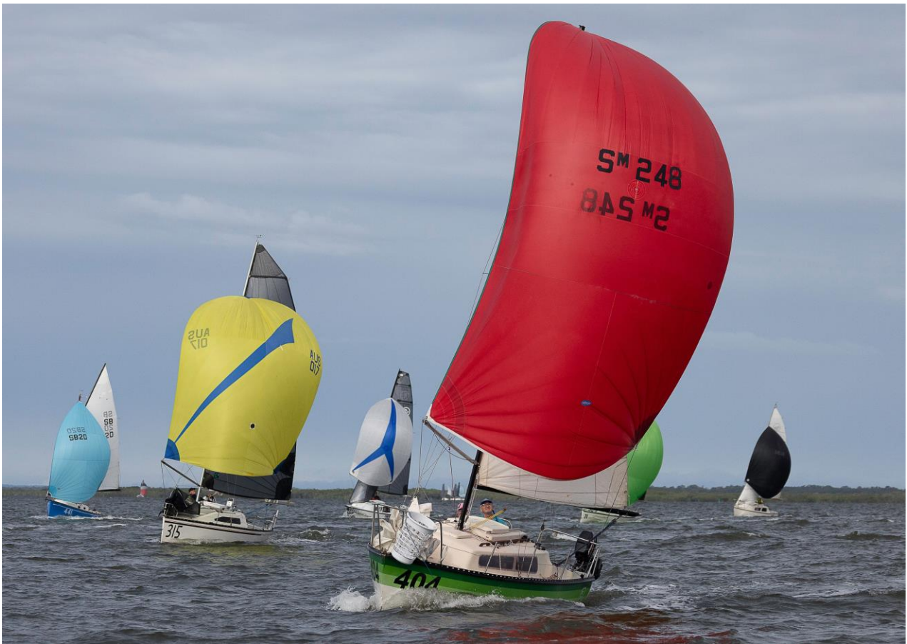
“Bay to Bay 2024” Trailable Yacht Race - Harvey Bay