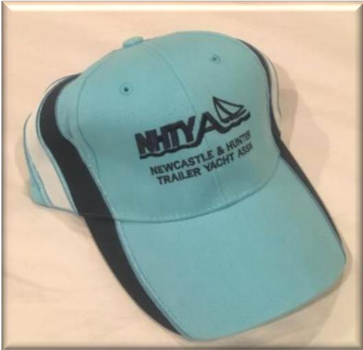
Caps $25 each