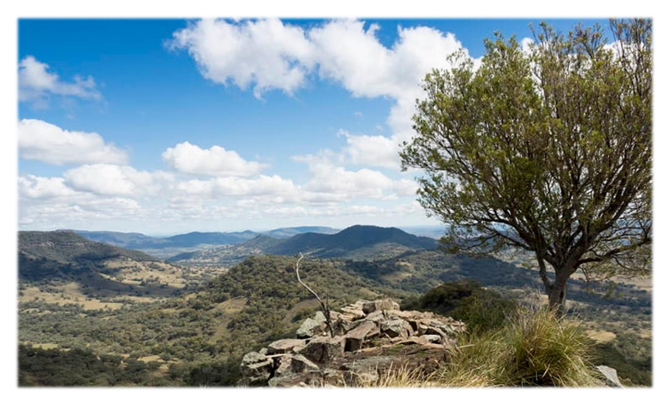
Around 3.5 hours from Styles via Hunter Expressway, Golden Highway and Vinegaroy Road.